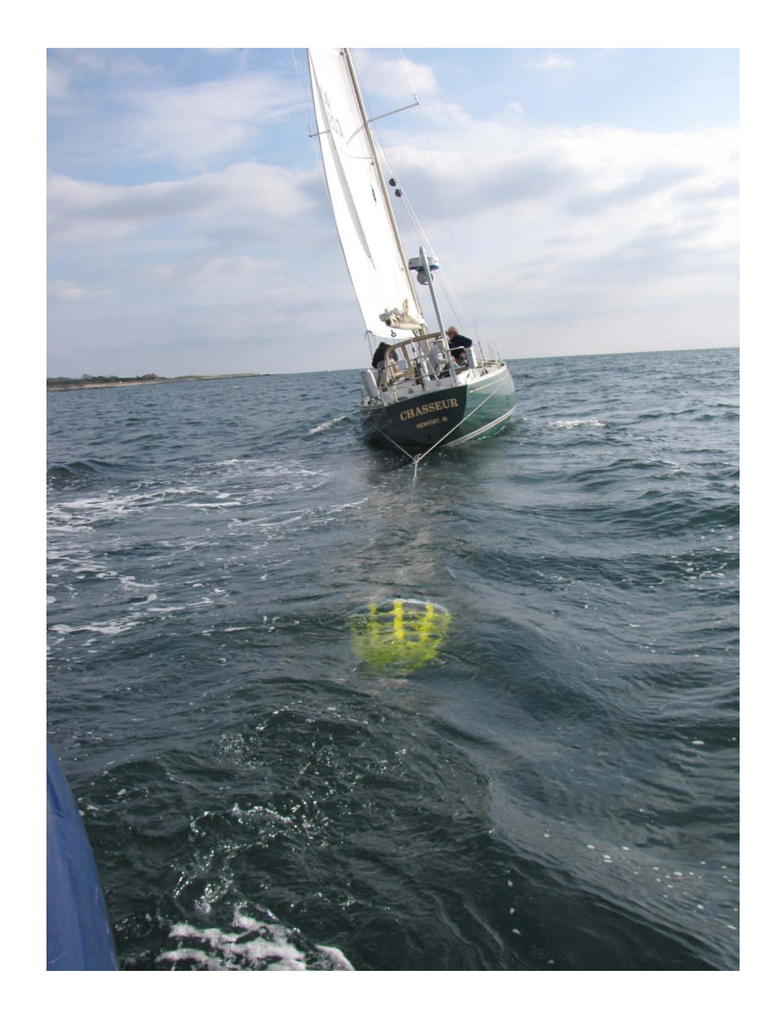
A Guide to Steering without a Rudder Methods and Equipment Tested Michael Keyworth

This guide was the result of multiple tests conducted in the fall of 2013 off of Newport, RI. The test vessel was a modified MK I Swan 44, Chasseur . Chasseur has been modified in the following